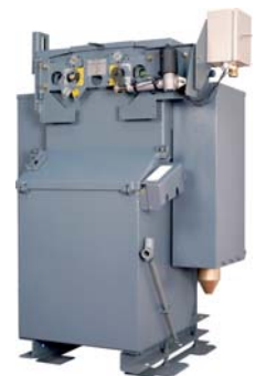
Trident with retrofit motor operation