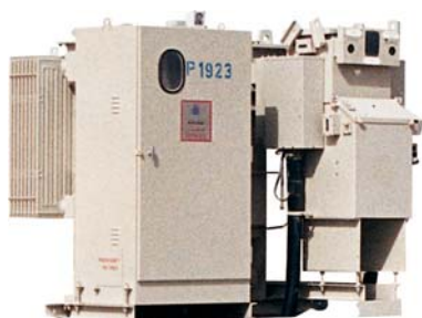
Trident Transformer Mounted